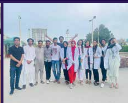
Ramadan Food Drive