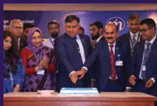
World Physical Therapy Day