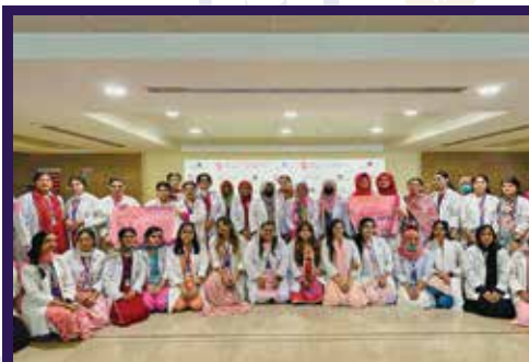
Breast Cancer Awareness