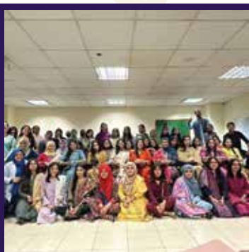
Eid Milan Party