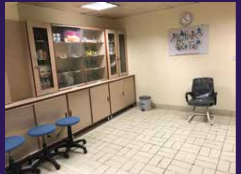
Exercise Physiology Lab / Kinesiology Lab