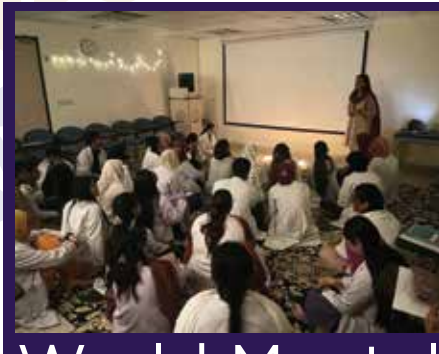
World Mental Health Day