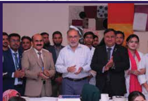
MCPRM Anniversary Celebration