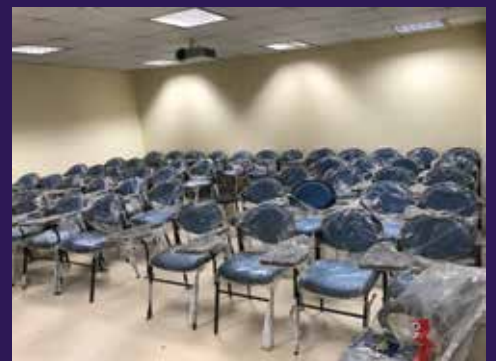
Digital Class Rooms