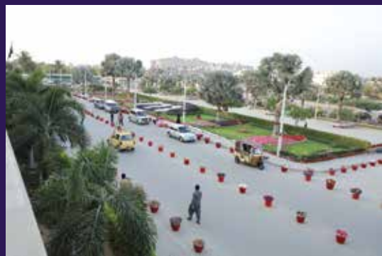
Lawn & Sitting Area