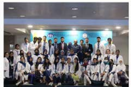
World PT Day