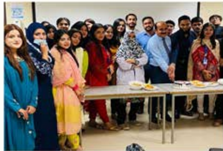
Eid Milan Party