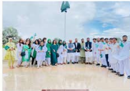
14 August Celebration